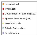
Budget for 2015/16 by financier

Many different types of reports can be produced: printed reports, as well as tables and charts that can be exported to Excel. The reports have been designed to make it easy to include information from PlAMES in AWPB documents and progress reports (copy and paste).